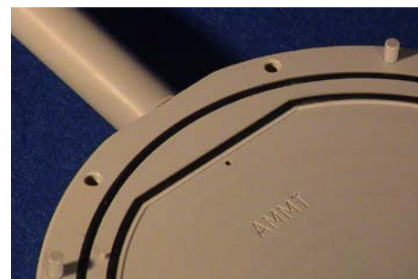
* Wafer holder with enlarge active area option (LAA), the o-ring shape is adapted to wafers flat.