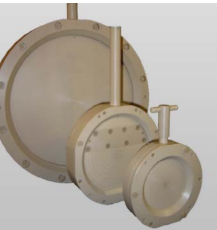
Single 12 (300 mm) , Single 6 (150 mm) and Single 4 (100 mm)

The Single wafer holders have been used for more than 15 years in MEMS industry and research. Wafer holders are available for wafers with 3", 4", 5", 6", and 8" diameters. The Single series wafer holder protects the wafer's back side and the edge from the etchant solution. Should etching capabilities for more than one wafer be required, AMMT offers the Tandem series of holders, which holds two wafers back to back.